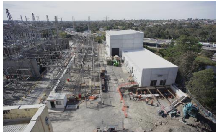
New 220kV Building and Control Room

The delivery of a large transformer took place in the early hours of the morning of Monday 23 rd May. Thank you to all local businesses and residents who complied with the parking restrictions necessary for both the delivery and the return journey of the transportation vehicle. Your cooperation is greatly appreciated and has ensured the safe delivery of this essential piece of equipment for the rebuild. The next transformer movement will be in early 2017.