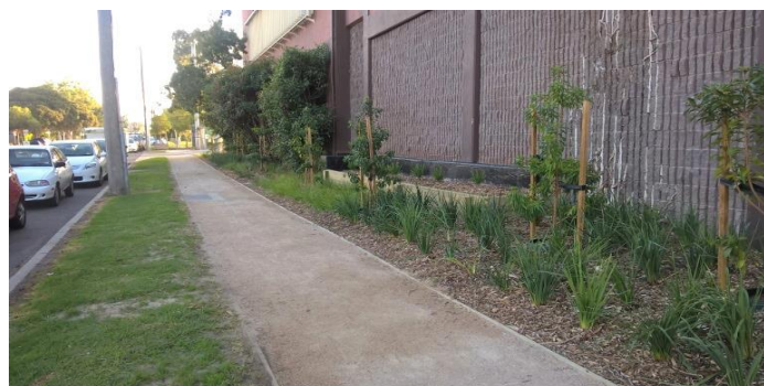
Mary Street landscaping and path

We are delighted with our recently completed landscaping in Mary Street. The new planting and path installation were carried out in association with, and with the approval of, Yarra Council and have significantly improved the nature strip area. This landscaping forms stage one of the approved plan for the Mary Street nature strip – Stage 2 will be completed towards the end of the project. For details of Stage 2 please refer to our project website.