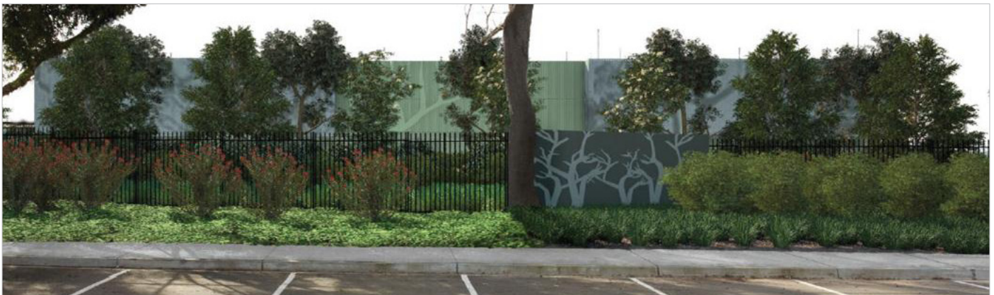
Artist impression of the upgraded Brunswick Terminal Station